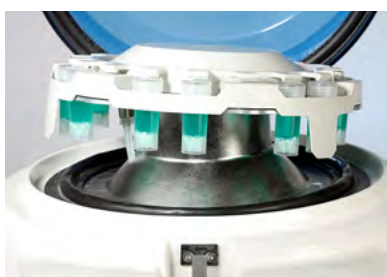
7mL accessories Up to 12 tubes of 7mL