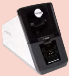
Minilyt® for personal use