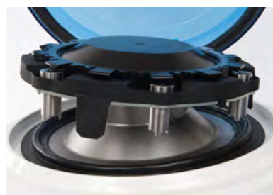
Metal tubes Up to 6 tubes (6mL accessories) Used for very hard samples