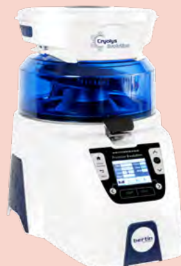
Precellys® Evolution + Cryolyt® Evolution combo