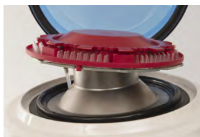
96 well-plate accessories From 8 to 96 wells of 0.3mL Prefilled 96 well-plates available