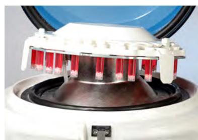
2mL accessories Up to 24 tubes of 2mL (or 0.5mL)

Fully adapted to any type of sample: 5 volumes of tubes and accessories