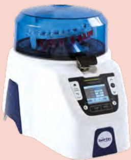
Precellys® Evolution Super Homogenizer