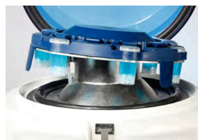
15mL accessories Up to 6 tubes of 15mL