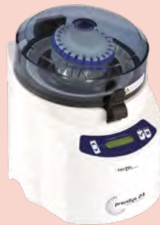
Precellys® 24 for high throughput