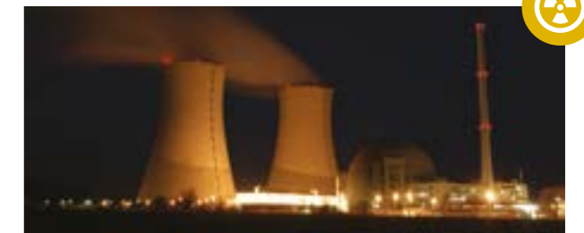
Nuclear Access Control