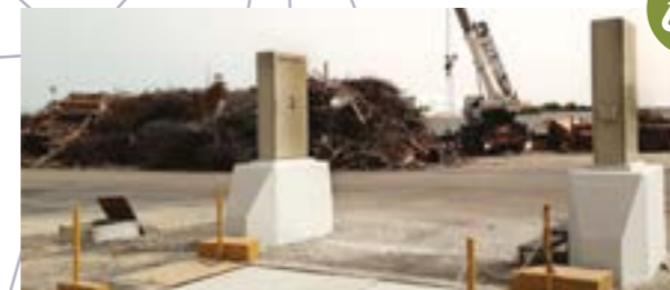
Waste and recycling Control