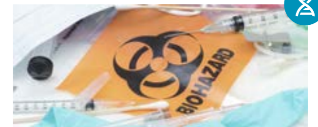
Hospital Waste Control